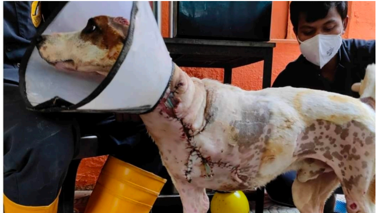
Hobbes, prior to treatment

Kaalia , arrived on the 26th of January (Republic Day) so weak he was unable to stand. He had really low haemoglobin and a maggot wound on his genitals just added to