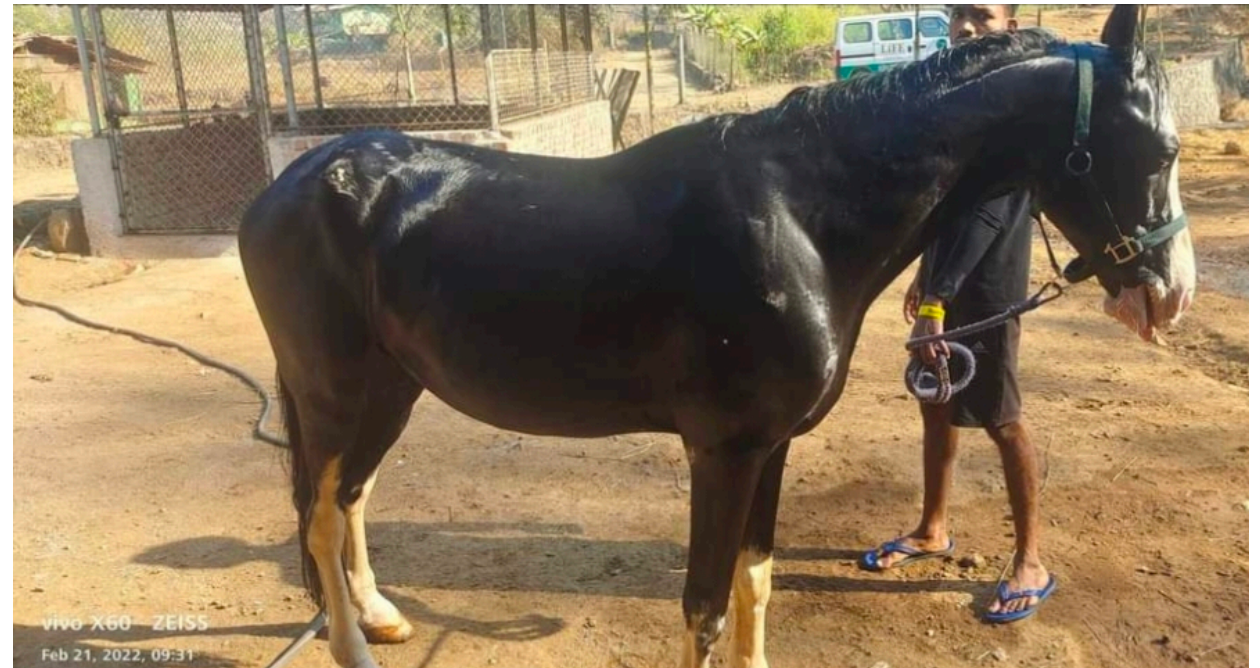
Kaalia, after treatment