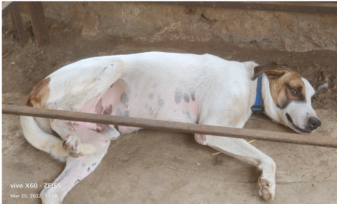
Hobbes, after treatment