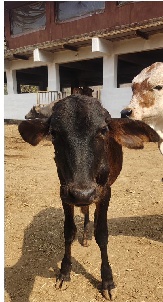
Sunny, our baby bull

We cannot thank our donors enough, who touch our lives with such beautiful gestures. Sparsh Foundation installed a CNG kit in our animal rescue van making it so much more cost effective to transport our pets to the shelter, for veterinary checks and emergencies.